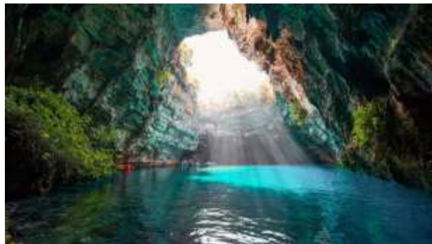
A remarkable geological phenomenon

Melissani , seems to be a lake, but it is actually part of an underground river. This underground stream starts at Katavóthres (swallow-holes) in Argostoli. The water streams underground through rifts in the limestone from west to east Kefalonia. After approx. 20 km the stream flows from Melissáni into the sea at Karavómilos lake outside of Sami.